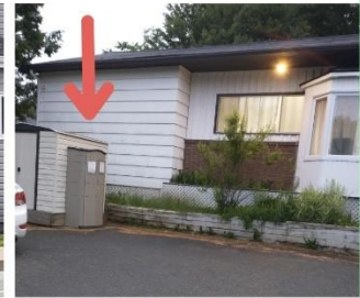
Al-Barakah Mosque 12 Hillcrest St.

Facebook: https://www.facebook.com/Fairviewfoodpantryproject