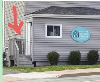
Fairview Resource Centre 6 Titus St.

*Please check expiry dates before donating